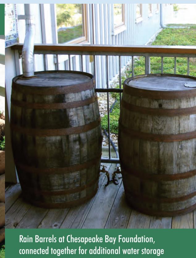
Rain Barrels at Chesapeake Bay Foundation, connected together for additional water storage