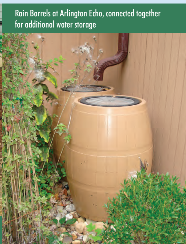
Rain Barrels at Arlington Echo, connected together for additional water storage