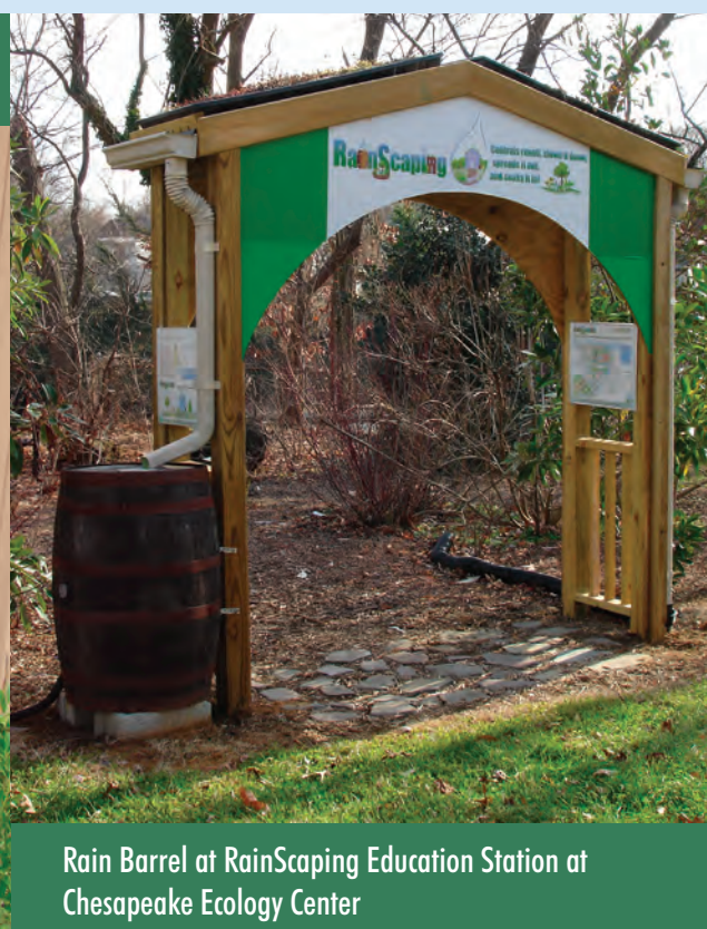
Rain Barrel at RainScaping Education Station at Chesapeake Ecology Center