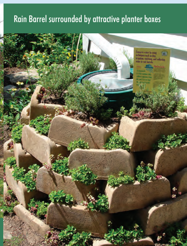
Rain Barrel surrounded by attractive planter boxes