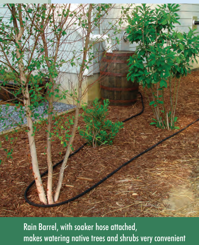
Rain Barrel, with soaker hose attached, makes watering native trees and shrubs very convenient

Reduce runoff—slow it down, spread it out, soak it in!